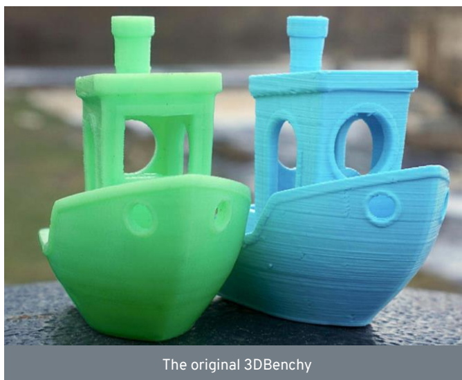
The original 3DBenchy

The immense popularity of 3DBenchy quickly made the original model widely recognizable. The 3D printing community embraced it wholeheartedly, creating numerous versions despite the licensing restrictions. However, Creative Tools never had to enforce the “No Derivatives” clause, as the community respected 3DBenchy’s original purpose.